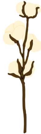
Finished Cotton Stem