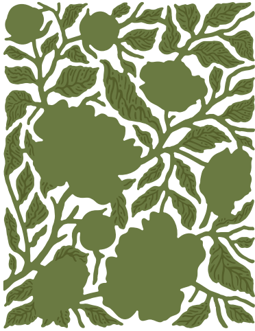
BASE OF LEAVES